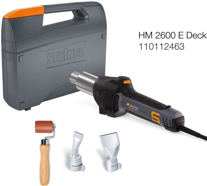
HM 2600 E Decking Kit: 110112463